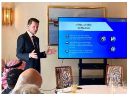
Presentation of the ECCKSA to Business Sweden