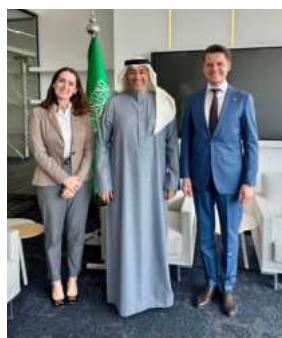
Meeting with the Saudi Ministry of Health