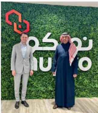
Meeting with NUPCO