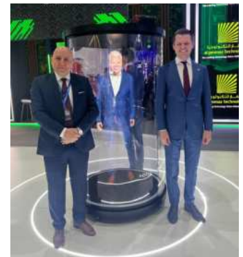
Meeting with NOKIA at LEAP 2025