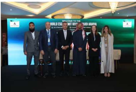
Panel moderation at the World ESG Summit