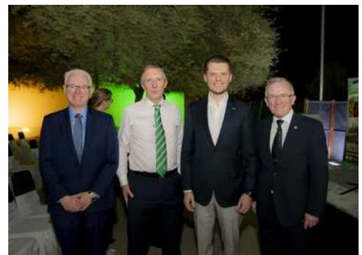
Presence at the Irish Business Network Saudi Arabia