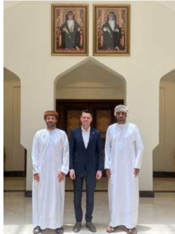
Meeting with the Embassy of the Sultanate of Oman and Oman Investment Authority