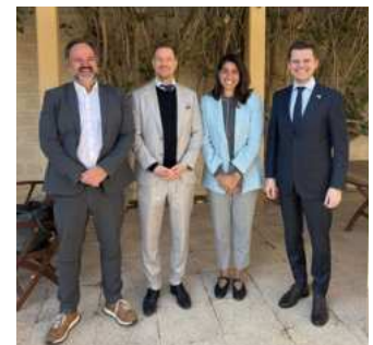
Breakfast Roundtable at the Residence of the Swiss Ambassador