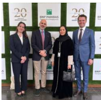
Opening of BNP Paribas' New Offices