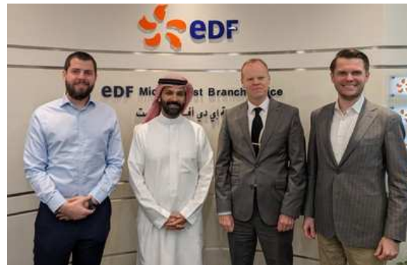
Meeting with our board members