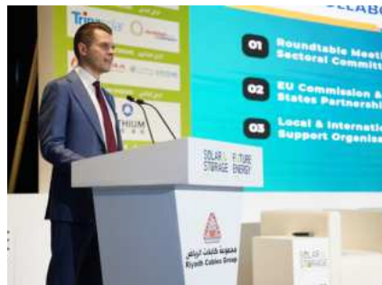
Keynote at the Solar & Storage Live KSA