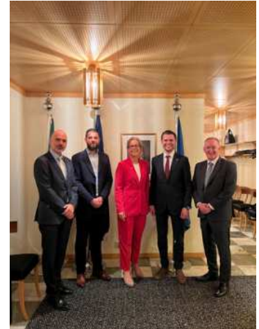
Reception at the Residence of the Swedish Ambassador