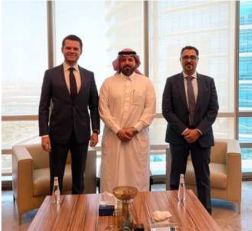
Meeting with H.E. Albara Alaskandarani, Deputy Minister for International Economic Affairs at the Ministry of Economy and Planning