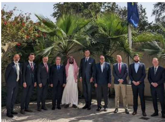
Board Members Lunch Meeting at the Residence of the EU Ambassador

Notable examples include Seamless Saudi Arabia, Milken Institute Abu Dhabi, CPHI Middle East, World ESG Summit among many others. These events offer us valuable opportunities to connect, collaborate, and stay at the forefront of industry developments.