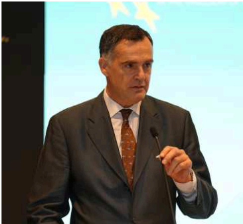
H.E. Christophe Farnaud