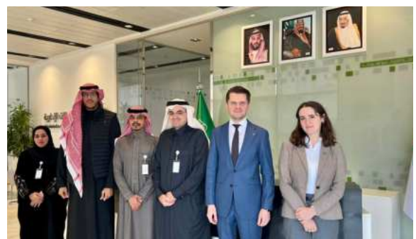
Meeting with the Saudi Food & Drug Authority (SFDA)