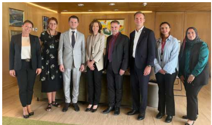
Meeting with the Norwegian Embassy in KSA