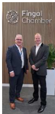
Meeting with Fingal Chamber